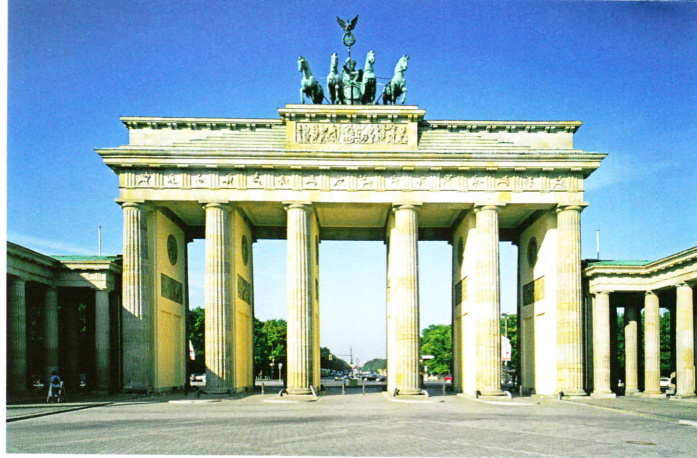
The Brandenburg Gate

Since November 2006, 24hr shopping from Monday to Saturday in Berlin is allowed. The shops can also open on six Sundays and Advent Sundays. Many shopping cen-